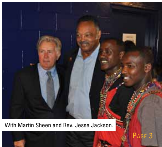
With Martin Sheen and Rev. Jesse Jackson.