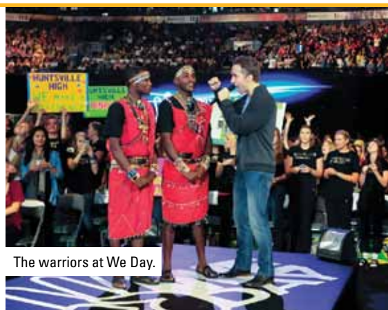
The warriors at We Day.